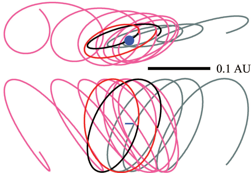
Fig. 1. The motion of 2003 YN 107 from 1995 (pink endpoint) to 2007 (grey endpoint) shows quasi-satellite loops as viewed from above Earth (top) and from a point outside Earth's orbit looking past Earth in toward the Sun (bottom), in a frame revolving with Earth. The period December 27, 2002 to December 27, 2003 is shown in red, then to December 27, 2004 in black, to highlight the nearly closed, high-inclination "orbits" of a one-year period. Although the loops nearly close at the end of this two-year period, individual loops are not closed. Earth (not to scale) is indicated by a blue dot.